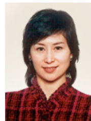
Pansy Ho, Managing Director, Shun Tak Holdings Limited