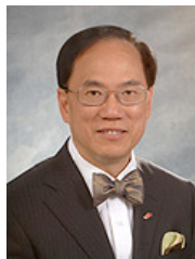
Donald Tsang, Chief Executive, HKSAR